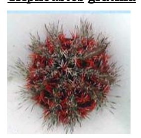
Tripneustes gratilla Sea urchin (Shirahige-uni)

<u>Tripneustes</u> <u>gratilla</u> is widely distributed in the tropical and subtropical region of Indo-west Pacific Ocean to the south of Sagami bay. This sea urchin, which is delicious, is caught as fishery target. Recently, this stock has been decreased by over fishing. So we have made effort to develop a technique of seed production in order to improve the condition of