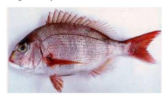
Pagrus major Red sea bream (Madai)

We started seed production of red sea bream, <u>Pagrus major</u>, in 1988, in order to promote fish aquaculture in Okinawa prefecture. And we have produced and supplied seeds for aquaculture since 1989. We have controlled spawning period regulating water temperature and photoperiod, in order to early spawning and early seed production.