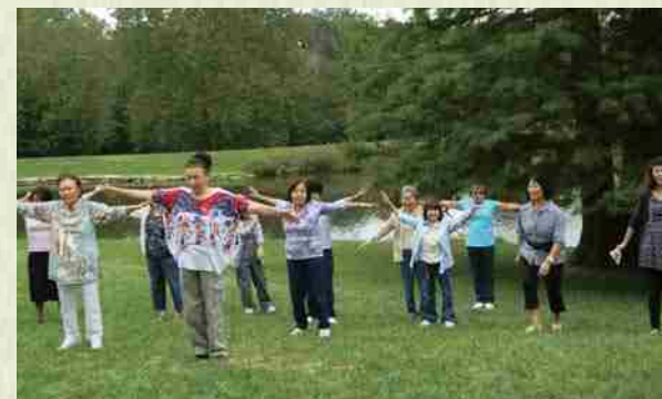
2013 Fall Picnic Keeping fit with Radio Taiso! Ichi, ni, Ichi, ni!

52 active members, comprised mostly of Issei and Nisei.