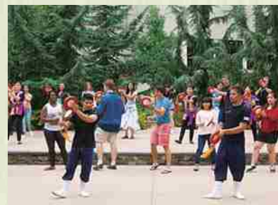
September 2015 – Eisa Workshop: We welcomed a number of Eisa instructors and held a workshop.