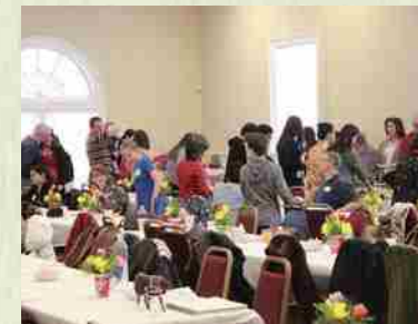
New Year's Party: Indiana gets very chilly in the winter, so we always hold our New Year's Party a bit before or after the actual New Year's Day. It's an opportunity for exchange with other states, and to improve at dancing, the shamisen, and more.