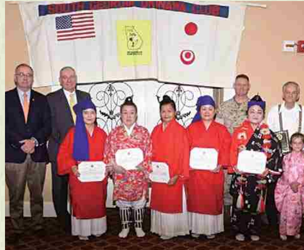
Pacific Island Regions Day of Thanks.

Founded in 2007, we introduce Okinawa's traditional performing arts to our region through Buyo, Taiko, and more.