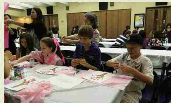
2014 New Spring Celebration Learning origami from our Issei Obaachans!