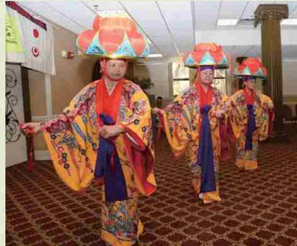
An elegant Yotsutake performance on the Day of Thanks.