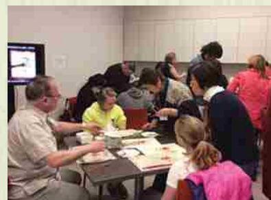
March 2015 – Bingata Workshop: Held at the George Washington University Textile Museum.