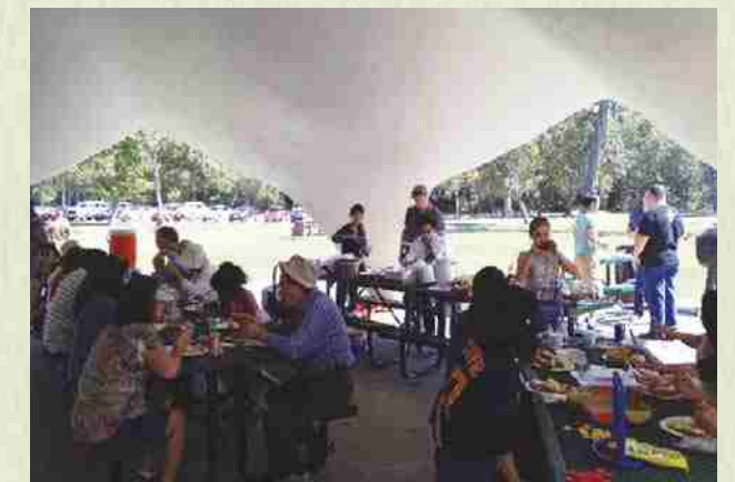
In January of last year, we held a New Year's celebration That included specially made food from the Kenjinkai, Ryukyu Taiko, and more. In May, we held a luncheon with karaoke, a Yuntaku-kai, etc. In October, we held a picnic.