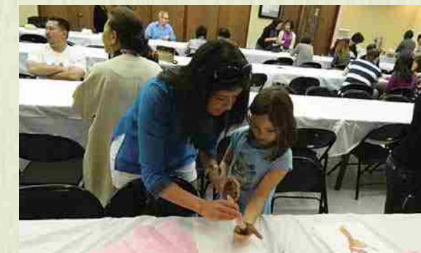
2014 New Spring Celebration Getting our hands dirty while enjoying some arts & crafts!