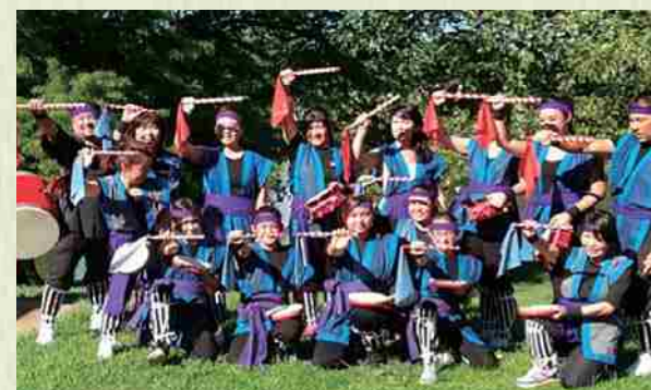
The 2015 Japan Festival Our friendly Eisa group is comprised of Issei, Nisei, and Sansei.