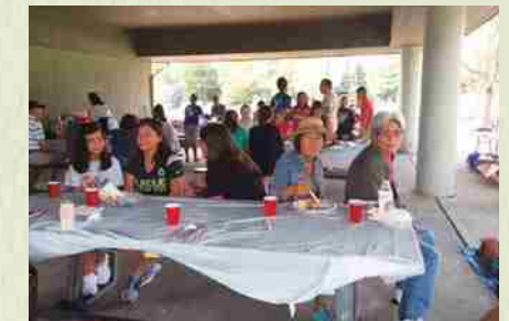
Summer Picnic: A fun event centered on fostering friendship between members. There are games for the kids, tug-of-war for the adults, and more.