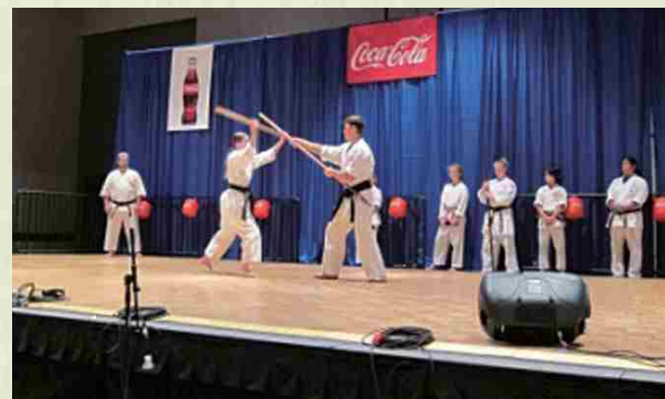
September 2015 – Promoting Okinawan traditional performing arts, tourism, and more at the Japan Festival. Included performances of “Jinjin” by the Mirai Kanai Eisa Troupe, a karate demonstration, clay Shisa making, and more.