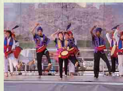
April 2015 – Performing at a “Street Festival” and introducing Okinawan culture during the National Cherry Blossom Festival.