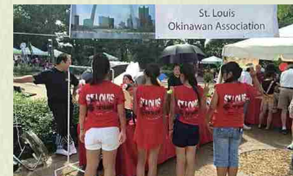
The 2015 Japan Festival Members showing off their matching shirts in front of the Association booth.