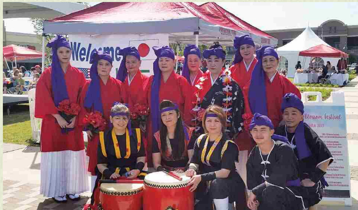
Joint picture of the Eisa and Hanaodori groups at the Tuscaloosa, AL Cherry Blossom Festival.