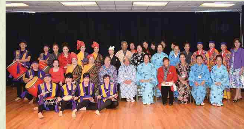
Utah Okinawa Kenjinkai 25th Anniversary Event - The performers.

We hold Okinawan cultural activities, and create opportunities for exchange and the deepening of friendships.