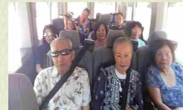
August 2014 A super fun visit to the Atlanta kenjinkai!