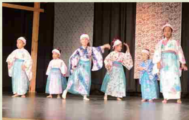
April 2015 - Okinawakai of Washington D.C. yearly New Spring Celebration: This event is meant to foster friendly exchange between members while enjoying Okinawan culture.