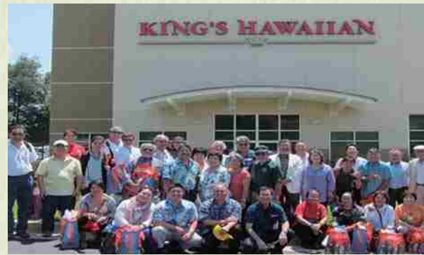
Okinawan executives on a business visit, and the same executives visiting the King's Hawaiian Bakery.