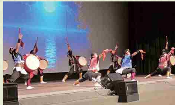
August 2015 – At the Atlanta Okinawa Kenjinkai 30th Anniversary Ceremony, and sharing with the members of WUB. Okinawans living in Atlanta welcomed the Luck Eisa Troupe from Ginoza Village, who wowed the audience with their energetic performance.