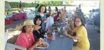
August, Summer Picnic Some long-time reunions followed by lively conversation.