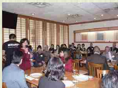
January 2015 – Okinawakai of Washington D.C. yearly New Year's Celebration: This event is meant to foster friendly exchange between members.

Our goal is to promote exchange between members while enjoying Okinawan culture.