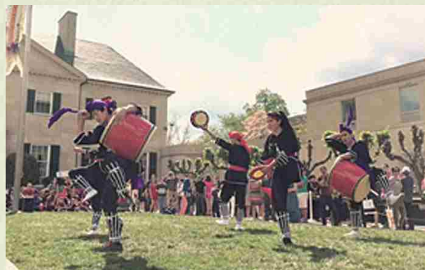
May 2015 – Performing during the Around the World Embassy Tour: A day when many foreign embassies in DC open their doors to the general public. This picture depicts an Eisa performance in the garden of the old official residence of the Japanese ambassador.