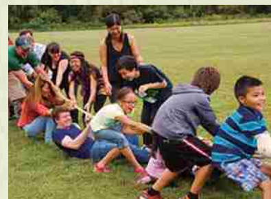
September 2015 – Fall Picnic: An Okinawakai of Washington D.C. yearly event.