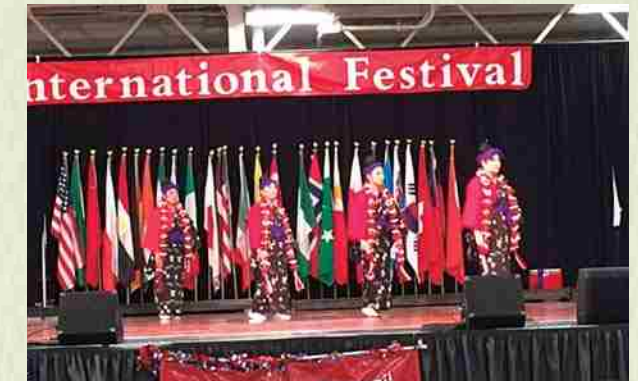
International Festival: Since 11 years ago, we have participated in the International Festival, where groups from around the world gather and perform. Aside from sharing our culture through dance performances, goods are also sold to cover expenses.