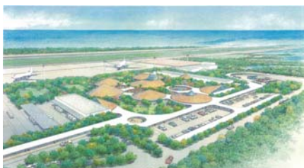
Artist's Impression *subject to change in the course of consultations with authorities

Shimojishima Airport will serve as a secondary airport for Miyako Islands to complement with Miyako Airport.